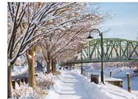
State Street Bridge