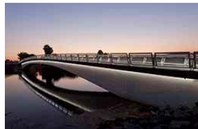
Mike Gotch Memorial Bridge