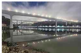
St. John's Bridge