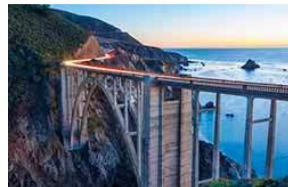
Bixby Creek Bridge