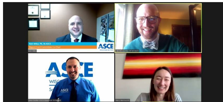
Senator Tammy Balwin