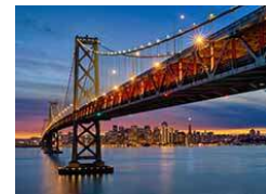
San Francisco-Oakland Bay Bridge