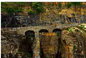
Triple Arches Bridge