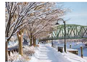
State Street Bridge