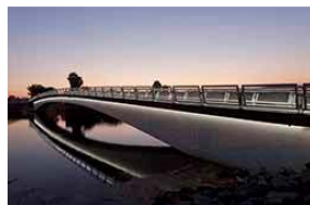
Mike Gotch Memorial Bridge