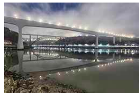
St. John's Bridge