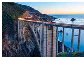
Bixby Creek Bridge