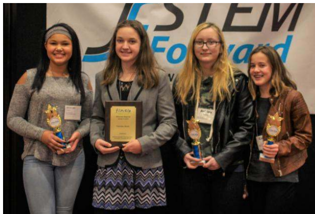
High Pine Haven - Whitman Middle School