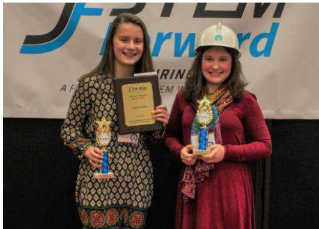
Amanecer-Longfellow Middle School

The ASCE Wisconsin Section Southeast Branch also selected four groups for the Exemplary Model Award. The Models and School are listed below: