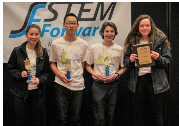
New Madidam - Glen Hills Middle School

Congratulations to all of our award recipients!